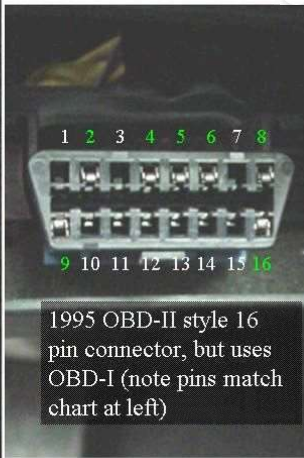
1995 OBD-II style 16 pin connector, but uses OBD-I (note pins match chart at left)